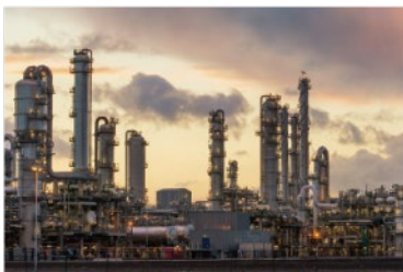
▲ Petrochemical & Chemical Industry