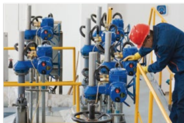
▲ Other Industries