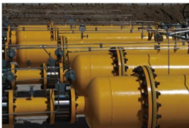
▲ Municipal Engineering & Utilities