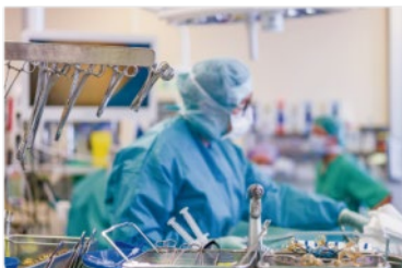
▲ Food & Pharmaceutical Industry