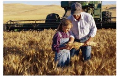
▲ Agricultural & Environmental Protection