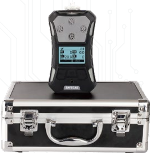
SKY3000 — Portable gas detector

SKY3000 series is a high-performance portable gas detector that can detect multiple gases (Oxygen compounds VOC, combustible gas and toxic gas) at the same time and has man down alarm function. The device has humanized operation functions such as one-key security detection, one-key storage, automatic image flipping, as well as the man down alarm function; With optional Bluetooth transmission function, allowing safety personnel to obtain real-time data and the alarm status. It has obtained international IECEx, ATEX explosion-proof certification and Chinese explosion-proof certification; As it passed the antistatic test, and the protection level reaches IP67; With safer product design and the module design which makes the detection faster, and the compact ergonomic design makes the device easy carrying; The instrument is mainly working in suction mode.