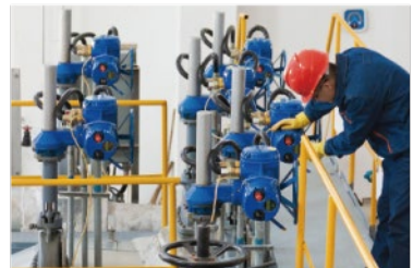
▲ Other Industries