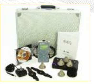
At the same time, the doseBadge also stores the highest Peak(C) level and the Battery level every minute. This data is available with the Time History data provided by using the supplied dBLink3 software program.

When the doseBadge is configured to 3dB (Q=3) with no Time Weighting or Threshold, this Time History data is stored as one-minute LAeq samples. For other configurations, the Time History data is stored as LAVG.