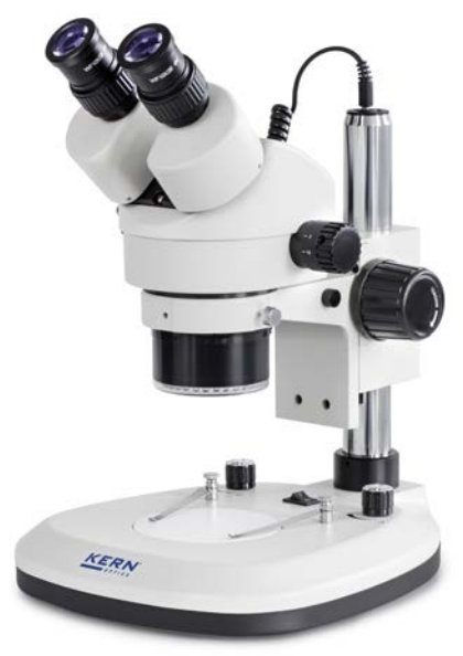
OZL 465 With ring illumination