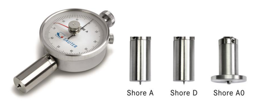
Shore A, Shore C / Shore 0 and Shore D

This Shore hardness tester is especially recommended for internal comparison measurements. Standard calibrations, e.g. to DIN 53505, are often not possible due to very tightly specified standard tolerances and are therefore not offered by SAUTER.