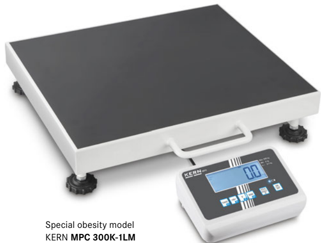
Special obesity model KERN MPC 300K-1LM