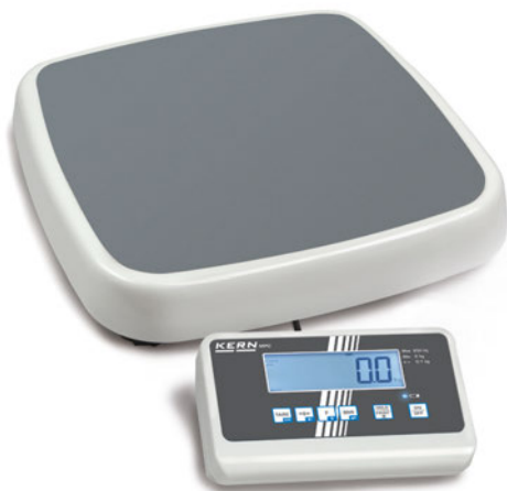
KERN MPC 250K100M