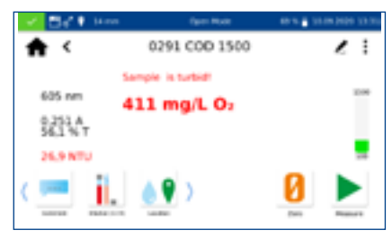
Fig. 11: NTU-Check

The NANOCOLOR® Advance provides a warning of interfering turbidity when measuring a test in the 16 mm and 24 mm test tube.