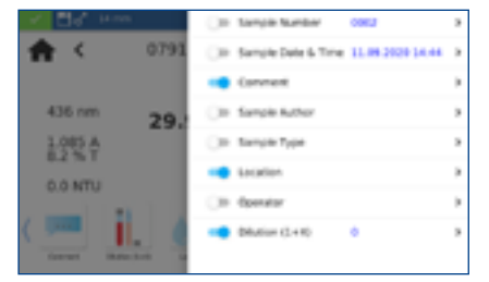
Fig. 9: Sample information

Below the measurement result are the icons for entering the sample information. The information comment, sample location and dilution are set here ex works.