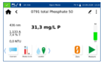
Fig. 8: Display of result

The end of the measurement is announced by an acoustic signal. The measurement result is shown on the display (Fig. 8). In addition to the measurement result, information on wavelength, absorbance and interfering turbidity is also given, depending on the settings.