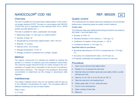
Fig. 6: Test kit instruction

Perform the test according to the instructions of the respective test kit (Fig. 6). Read them carefully to obtain accurate and reliable results. Prepare the sample according to the instructions.