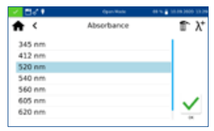
Fig. 10: Enter wavelengths

An absorbance measurement can be performed within the wavelength range of 340-800 nm for up to 20 different wavelengths simultaneously. By selecting Basic functions > Absorbance , the desired wavelengths can be entered via \lambda^+ (Fig. 10). Confirm the entry with clicking on "Enter". The entered value is accepted in the list. Press \checkmark to start the measurement process.