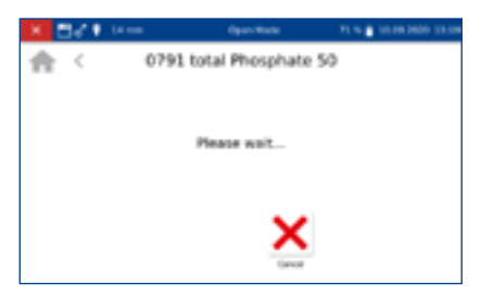
Fig. 7: Measurement of tube tests

Contaminated cuvettes can contaminate the cuvette slot and lead to incorrect measurement results.