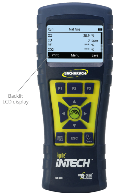
Backlit LCD display