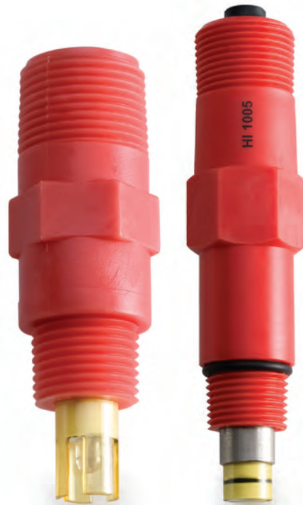
HI1000 and HI2000 series