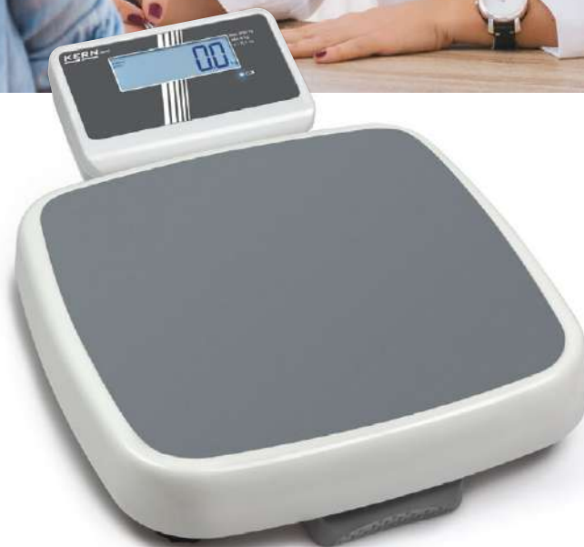
KERN MPD 250K100M