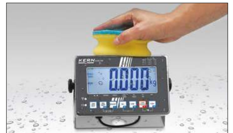
Stainless steel display device with IP68 protection , hygienic and easy to clean Benchtop stand incl. wall mount for display device as standard, for details see KERN KXS-TM