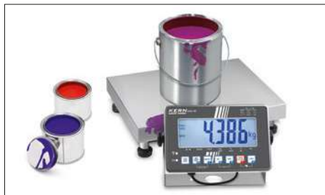
Durable stainless steel weighing plate