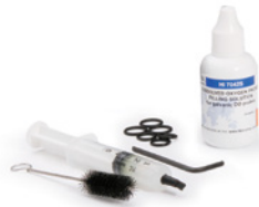
HI76981942 probe maintenance kit